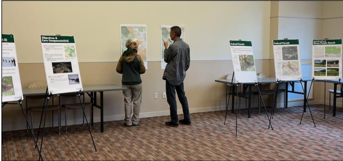
A USFS representative and meeting participant review the proposal map.