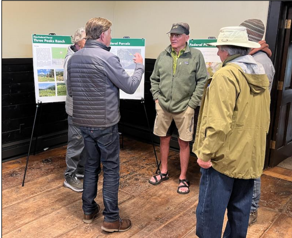
WLG talking with participants at the April 27 Information Session in Crested Butte.